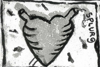
HEART THROBBING Action