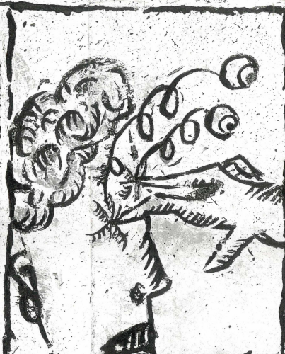
EYE POPPING Visuals