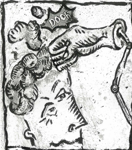
MIND WACKING Intellect